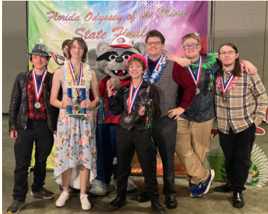
Team photo at the State Finals competition!