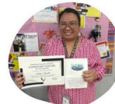
ELEMENTARY SELISTE ROSILLO